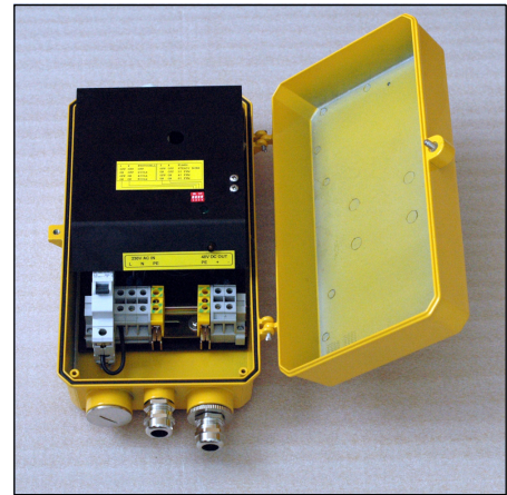
Obelux PS-06-05A Power Supply