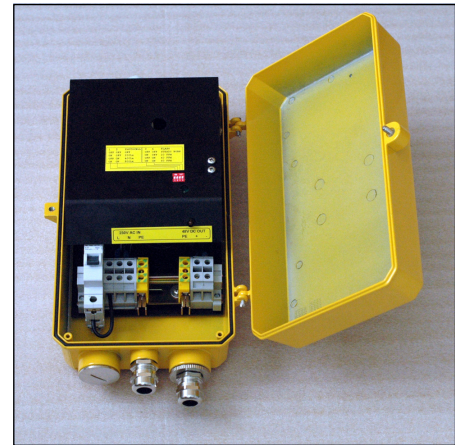
Obelux PS-115-48-05 Power Supply

Order Code: Obelux PS-115-48-05 Obelux PS-115-48-05-PCFL (with Photocell & Flash Controller)