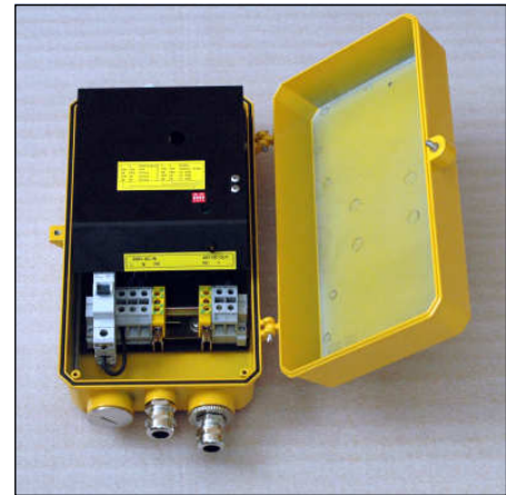
Obelux PS-230-24-09 Power Supply