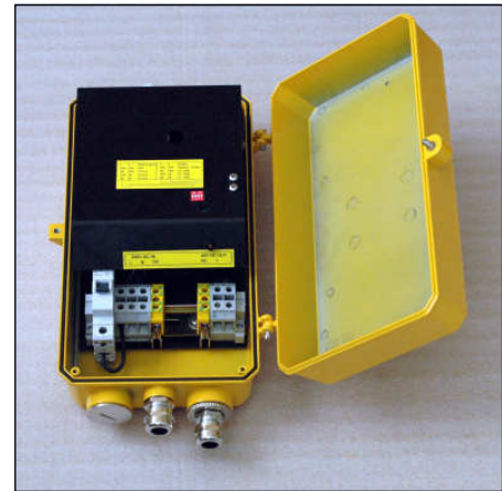
Obelux PS-230-24-3A5 Power Supply